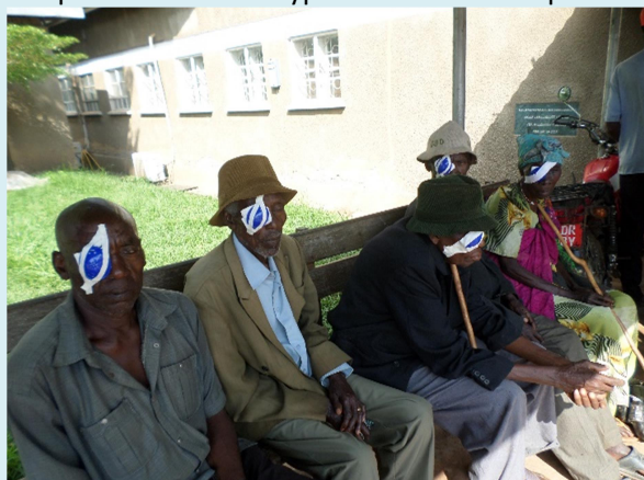
Patients who were operated upon line up for medical review

An eye care service is one of the specialized health care that is not easily accessed in remote hard to reach places. When need arises for eye care services, the community in the MVP area have to move to Mbarara town which is approximately over 60km away since the Ministry of Health does not provide eye care services in its primary health care packages. This is very costly in terms of transport costs, up-keep, eye care and treatment which end up ranging from 50 – 80 USD depending on the magnitude of the problem and the type of treatment required.