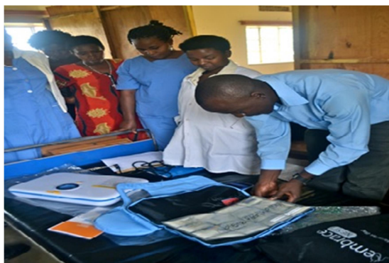
Health care workers in Ruhiira MVP being trained on the use of Embrace Warmers by the MVP RMNCH Facilitator

The Project also continued to partner with Embrace Innovations to distribute Embrace Warmers, which are inexpensive, safe and effective wraps that keep an infant warm to prevent death from hypothermia. Experts taught MVP healthcare workers to use them and closely supervised their work.