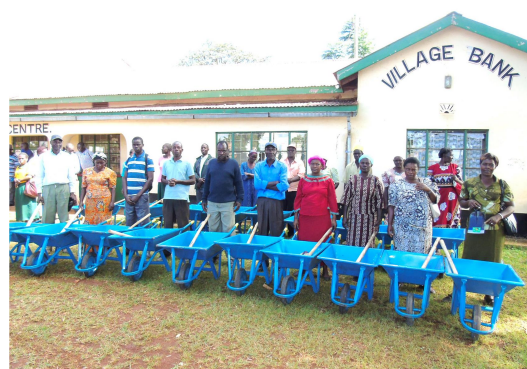
Lead farmers receive incentive farm implements in Sauri-Kenya

also grew by the end of 2015 to close to 4,000 farmers, elected by their peers and deployed to serve as Lead Farmers (LFs) across the MVP. LFs are innovative and successful farmers with aptitude and commitment to innovate and learn Good Agronomic Practices (GAP) from extension officers and they worked with approximately 100,000 farmers throughout the sites.