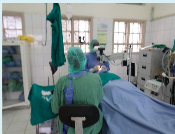
An eye patient in Theater being operated