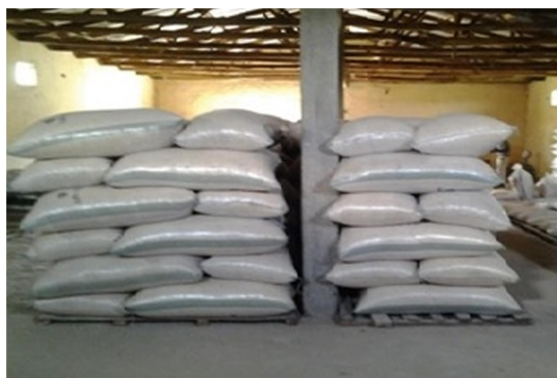
Grains for Fertilizer warehoused in Cereal bank - Pampaida

For example, in Pampaida the Project helped farmers partner with African Exchange Holdings (AFEX), a new investor in input and output markets, on a fertilizer-for-grains program. Through this initiative, interested farmers exchange one bag of maize for one bag of fertilizer based on the commodity's prevailing market price. The AFEX program provides farmers the opportunity to access quality, unadulterated fertilizers at their doorstep, saving money on transport to local markets.