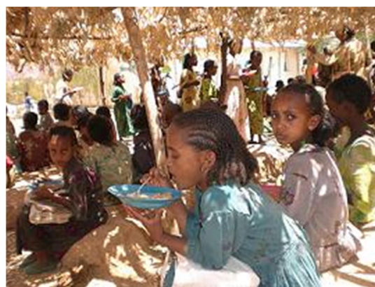
School meals program in Koraro, Ethiopia

The School Meals Program (SMP) is another important component of the Education sector, ensuring students are receiving the nutrition they need for physical and cognitive development, and helping them stay focused all day by not going hungry. In addition to providing meals at schools, training components accompanying school meals have been emphasized.