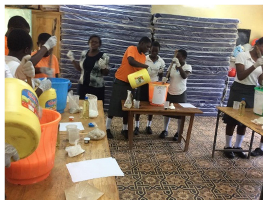
Vocational training session

In addition to providing scholarships for girls, CTL began to focus on vocational training to equip girls with skills they could utilize after school. Some of the vocational training would also lead to income generation and allow for girls to be able to cover their schooling expenses. For example, in Pampaida girls have been trained in soap-making; now the CTL scholars are producing most of the soap used to teach hygiene practices in primary schools. Other skills being taught to boys and girls include carpentry, clothes design and tailoring, and honey production.